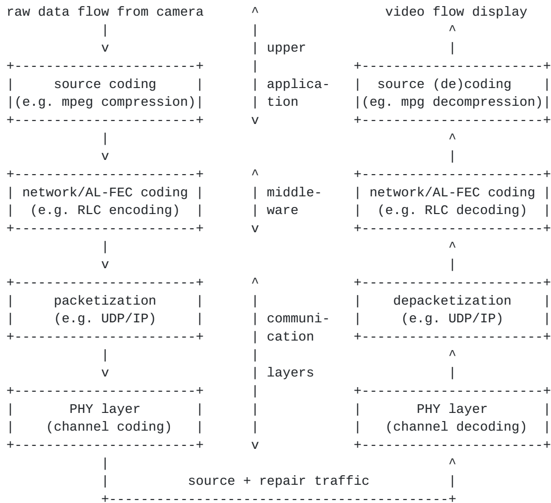
Figure 2: Example of end-to-end flow manipulation with Network Coding between the application and UDP layers (as with RMT or FECFRAME architectures). Other architectures are possible, for instance with network coding below the transport layer in order to allow re-coding within the network.

Intra-Flow Coding, or Single Source Network Coding: Process where incoming packets to the Coding Node belong to the same flow.