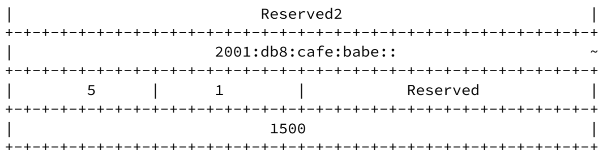
Figure 3: An RA with one implicit PVD and one explicit PVD