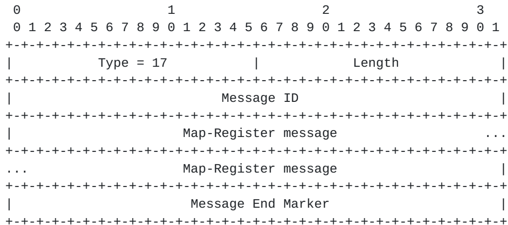
Registration message format

The reliable transport session is authenticated by means of the session establishment procedure. Thus, although the Map-Register MUST carry the authentication data, it is up to the map server to determine if each individual reliable registration message should be authenticated.