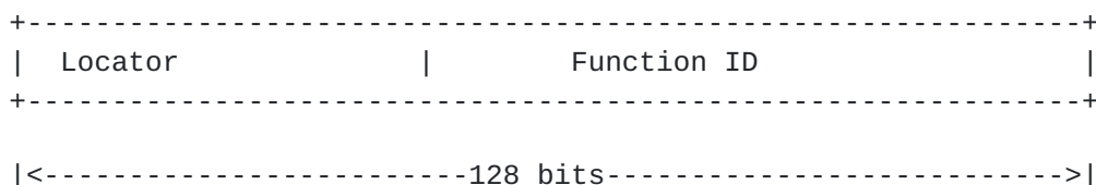
Figure 2. PSID in Format LOC:FUNCT

The Function Type of an SRv6 Path Segment is END.PSID (End Function with Path Segment Identifier).