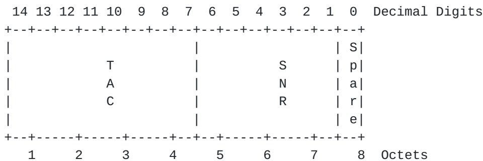
Figure 1. IMEI Format