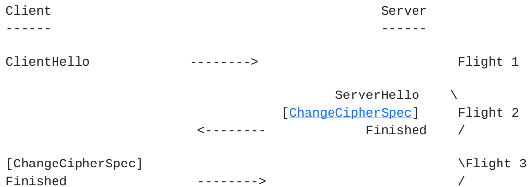
Figure 2: Message flights for session resuming handshake (no cookie exchange)

DTLS uses a simple timeout and retransmission scheme with the following state machine. Because DTLS clients send the first message (ClientHello) they start in the PREPARING state. DTLS servers start in the WAITING state, but with empty buffers and no retransmit timer.