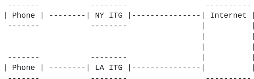
Figure 1: Internet Telephony Gateway

With the tremendous changes in the telecommunications industry, and the recent growth of the Internet, there is a new opportunity for offering long distance telephony over the Internet. Such a service can be offered by allowing users to dial a local access number, connecting them to a device called an Internet Telephony Gateway (ITG). This device prompts the user for a destination telephone number, and then routes the call over the Internet to a similar device at the local exchange of the destination. There, the call is completed when the destination ITG dials the end user. The scenario is depicted in Figure 1.