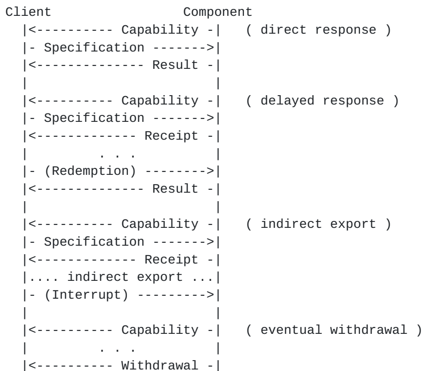
Figure 2: Possible sequences of messages in the mPlane protocol

The following sequences of messages are possible within the mPlane protocol: