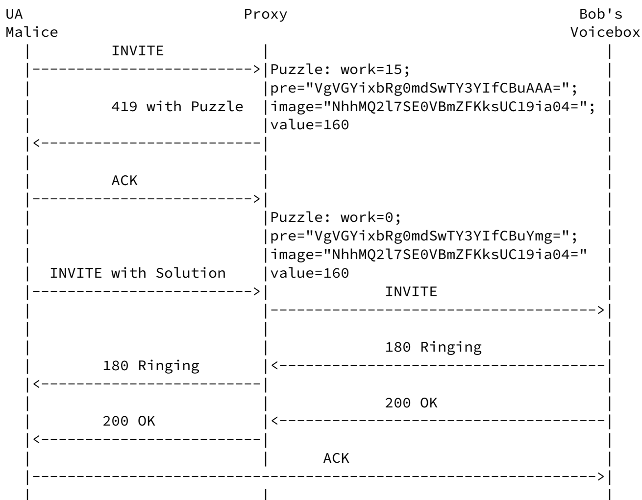
Figure 9: Example Exchange: Malice contacts Bob

in this example. Rule 3 indicates that an extended return-routability test using hashcash [ I-D.jennings-sip-hashcash ] is used with the call being redirected to Bob's voicebox afterwards. This exchange is shown in Figure 9.