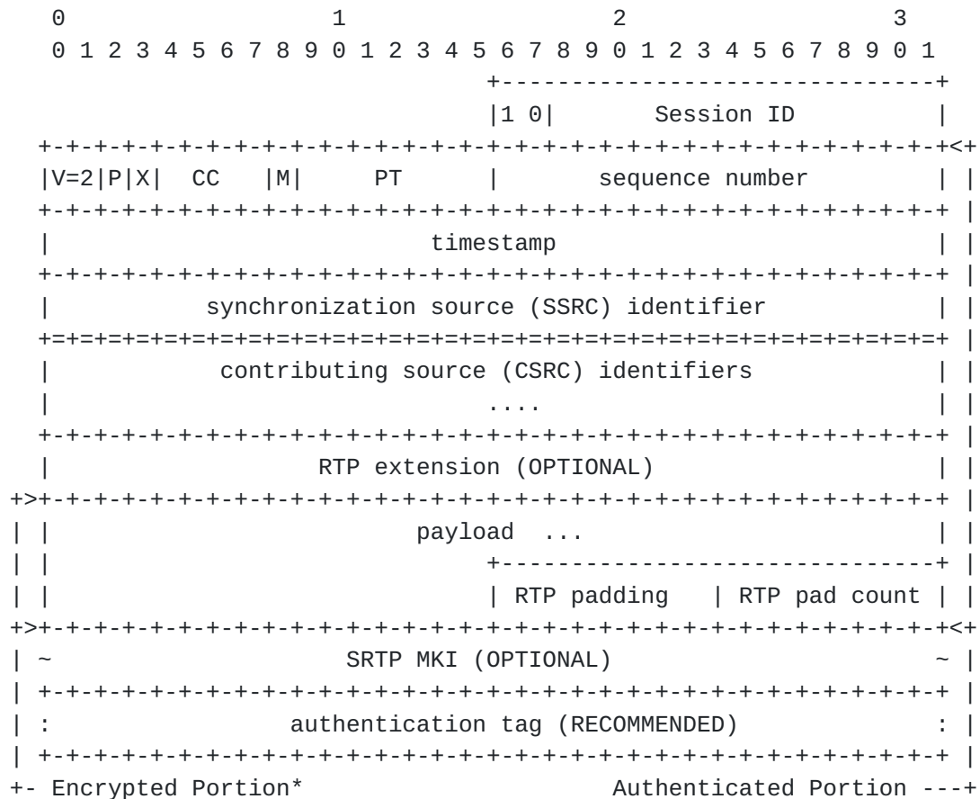
Figure 3: SRTP Packet encapsulated by Session ID Layer

Each Session ID value space is scoped by the underlying transport protocol. Common transport protocols like UDP [ RFC0768 ], DCCP [ RFC4340 ], TCP [ RFC0793 ], and SCTP [ RFC4960 ] can all be scoped by one or more 5-tuple (Transport protocol, source address and port, destination address and port). The case of multiple 5-tuples occur in the case of multi-unicast topologies, also called meshed multiparty RTP sessions or in case any application would need more than 8192 RTP sessions.