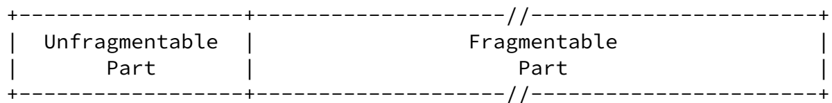
Figure 1: Large IPv6 Packet

This attack describes how a malicious node can bypass a firewall using overlapping fragments. Consider a sufficiently large IPv6 packet that needs to be fragmented.