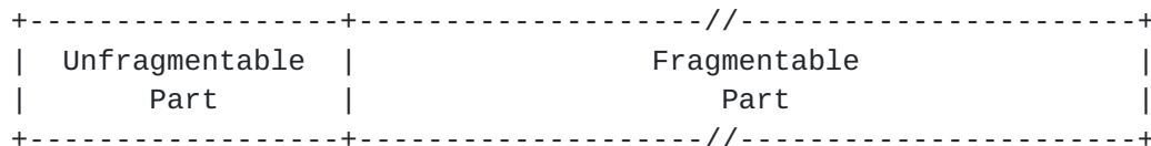
Figure 1: Large IPv6 Packet

This attack describes how a malicious node can bypass a firewall using overlapping fragments. Consider a sufficiently large IPv6 packet that needs to be fragmented.