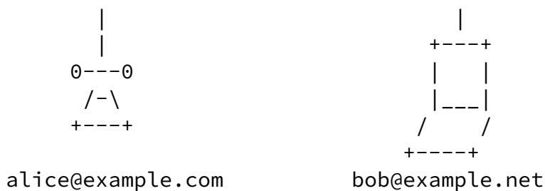
Figure 1: SIP Trapezoid

An user, alice@example.com , invites bob@example.net for a multimedia communication session. Alice's outbound proxy, Proxy-A.example.com , uses normal RFC 3263 [8] resolution rules to find a proxy -- Proxy-B.example.net -- in the example.net domain that uses TLS. Proxy-A actively establishes an interdomain TLS connection with Proxy-B and each presents a certificate to authenticate that connection.