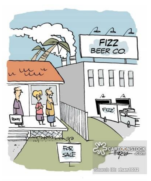
WE'LL TAKE IT!