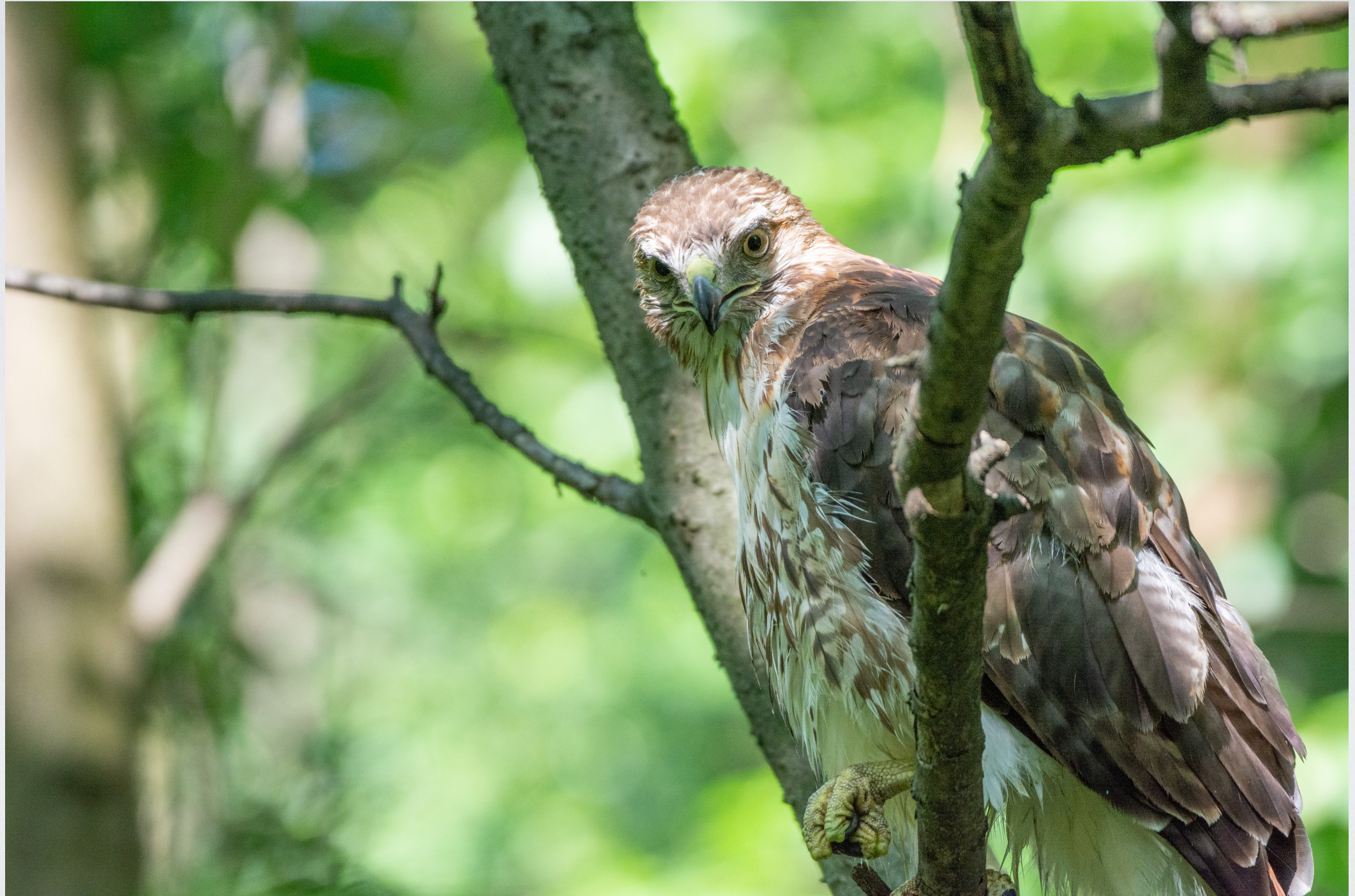
Central Park, New York City, July 2019