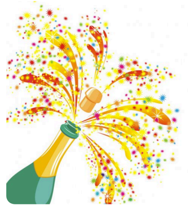
Fig.1: Autonomous opening of champagne bottle