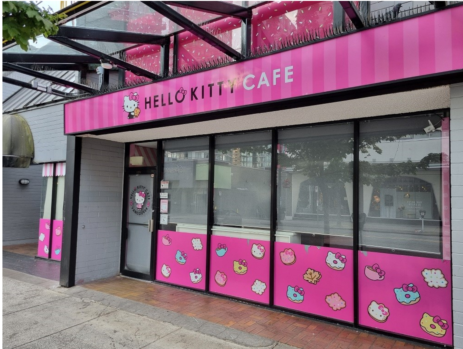
CATS WG - IETF 120, Vancouver – July 2024