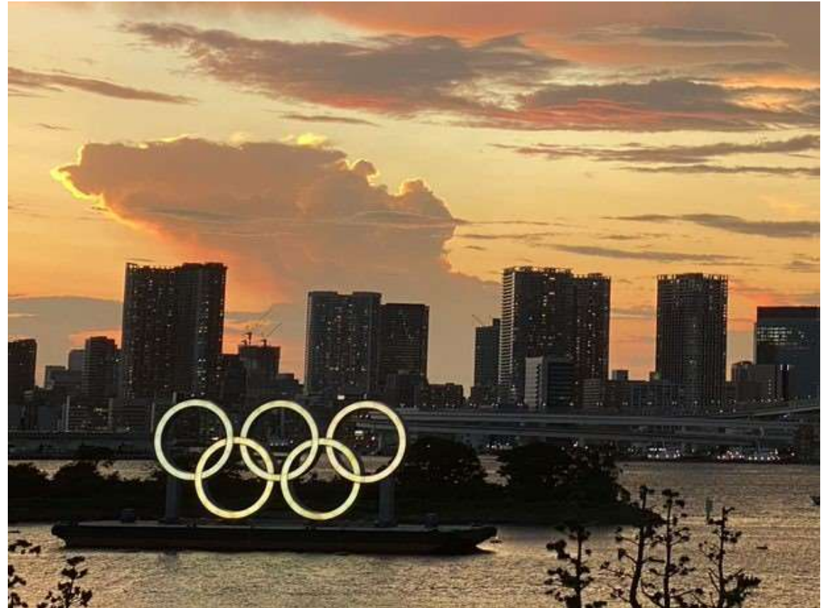
Tokyo Olympics 2021