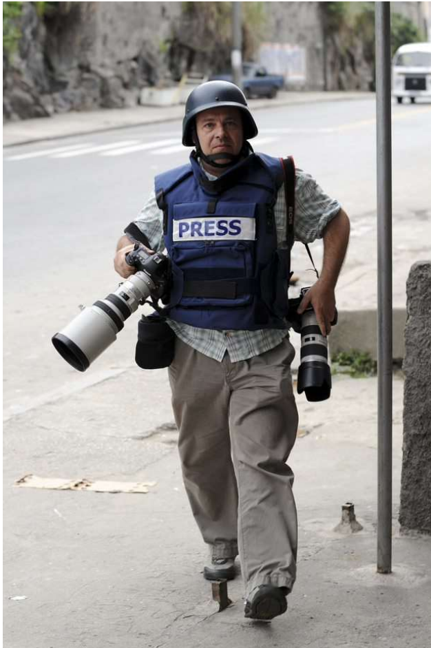
Reuters photographer carrying typical gear