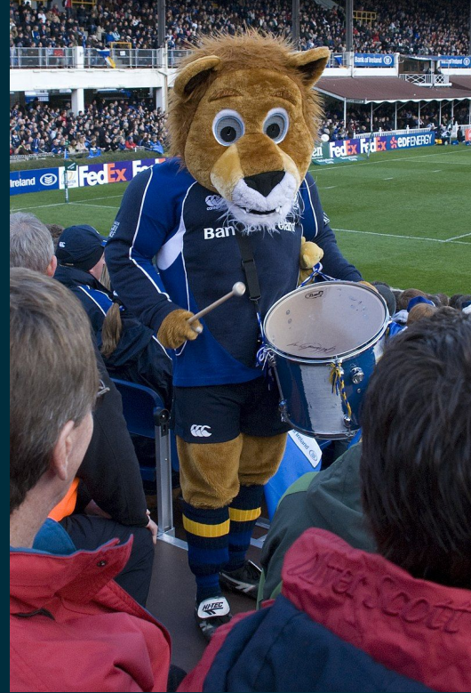
Leo the Leister Lion