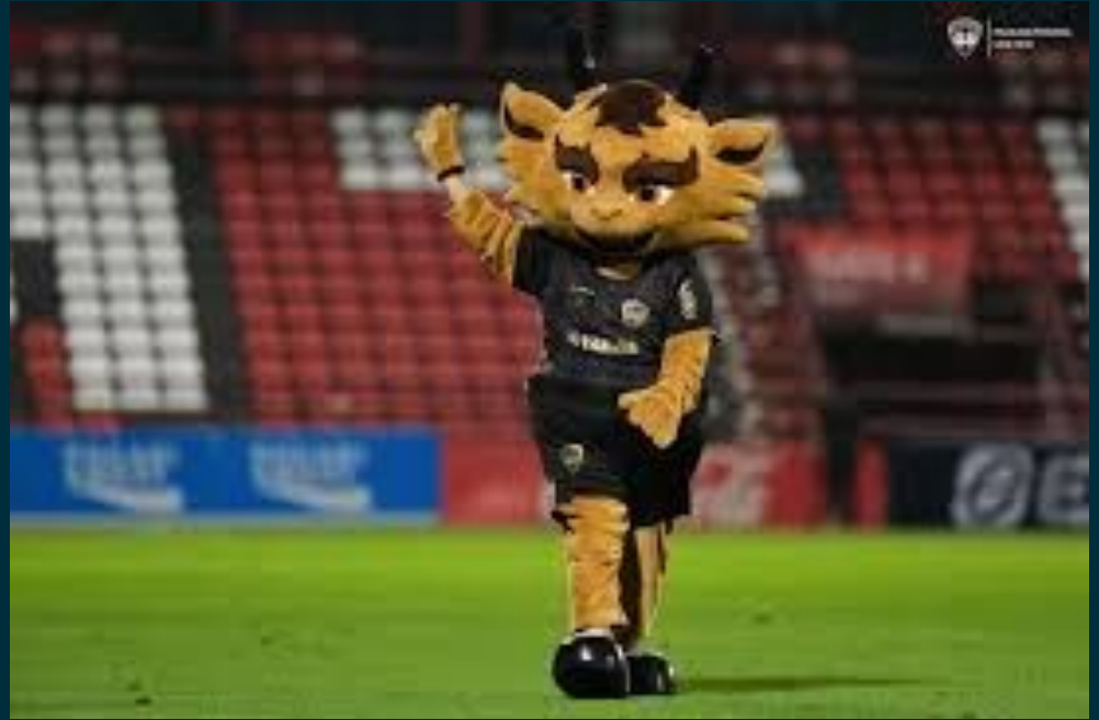
Kirin (Muangthong United F.C.)