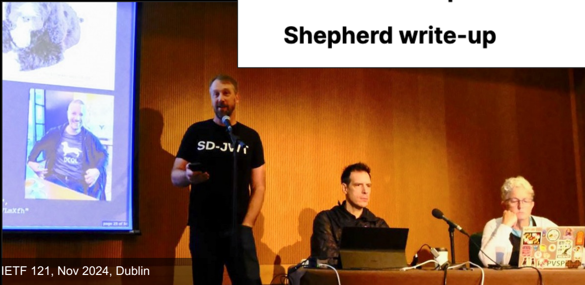
IETF 121, Nov 2024, Dublin