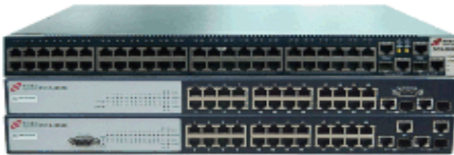
Digital china S3950 switches