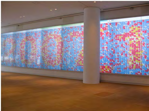
21 million-pixel display in IAC building