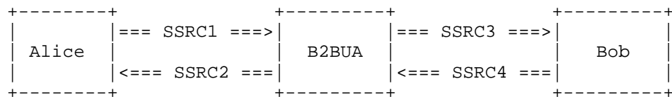
Figure 1: B2BUA modifying RTP headers

Whatever the reason, such a behaviour does not come without a cost. In fact, whenever a media-aware component is placed on the path between two or more participants that want to communicate by means of RTP/RTCP, the end-to-end nature of such protocols is broken. While this may not be a problem for RTP packets, which can be quite easily relayed, it definitely can cause serious issue for RTCP messages, which carry important information and feedback on the communication quality the participants are experiencing. Consider, for instance, the simple scenario only involving two participants and a single RTP session depicted in Figure 1: