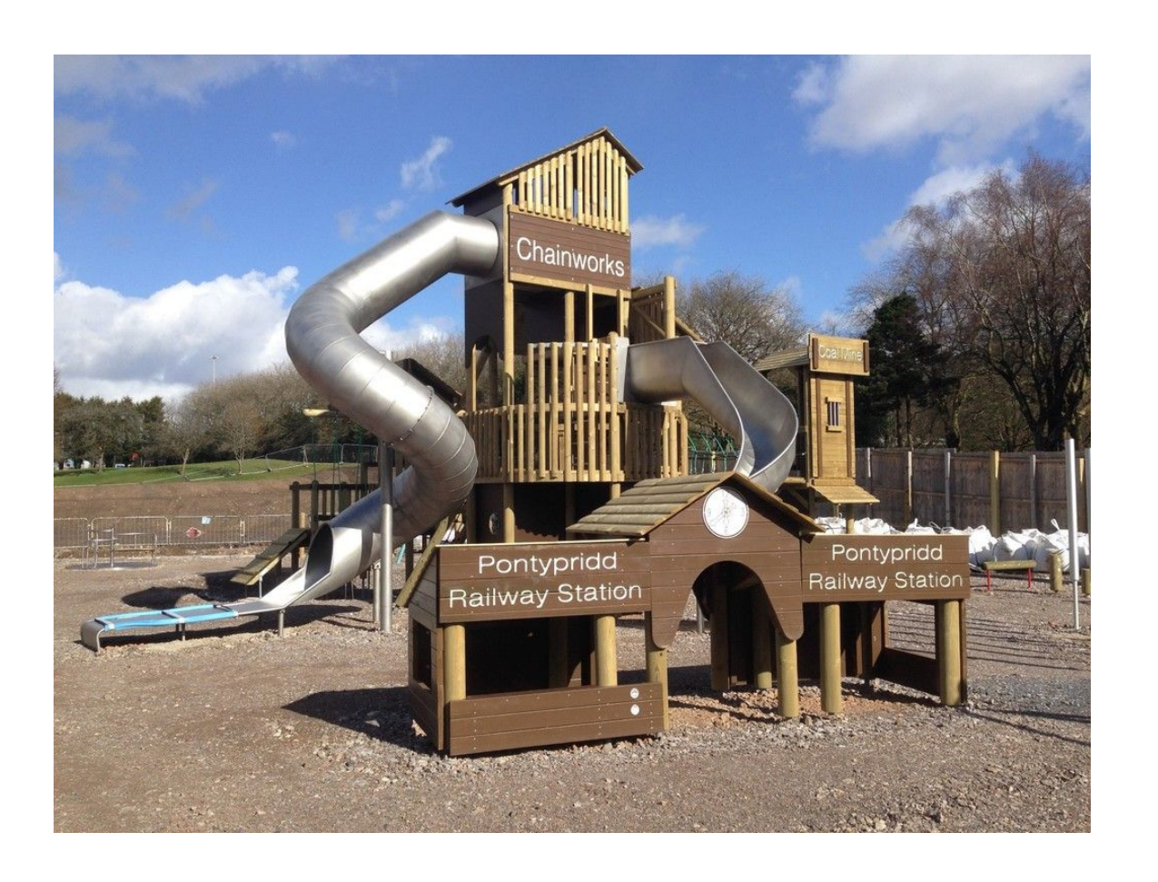
draft-schinazi-masque-h3-datagram - Virtual Interim - 2021-01