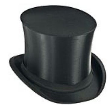
Mind Your Hat